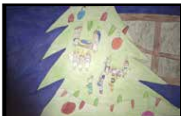
Bethany Perzinski 2nd Place Age group 8-10